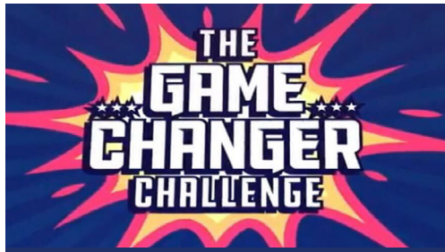
GAME CHANGER FINALISTS