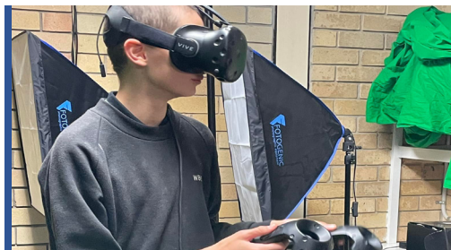
YEAR 9 HISTORY