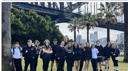
BANGARRA DANCE EXCURSION