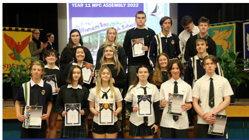
YEAR 11 PRESENTATIONS