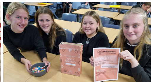
YEAR 8 COMMERCE