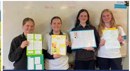
YEAR 10 FRENCH