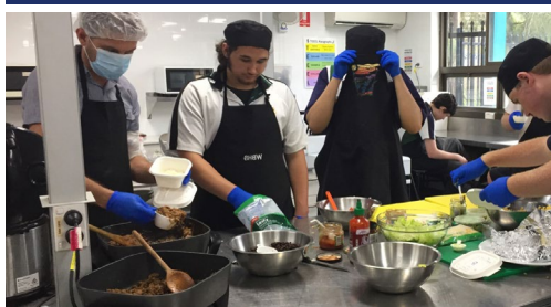
ALL STARS CAFÉ