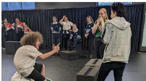
YR 12 DRAMA