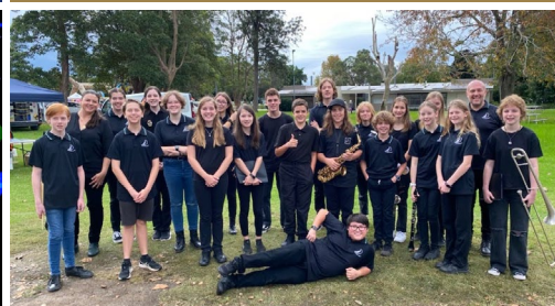
BIG BAND PERFORM