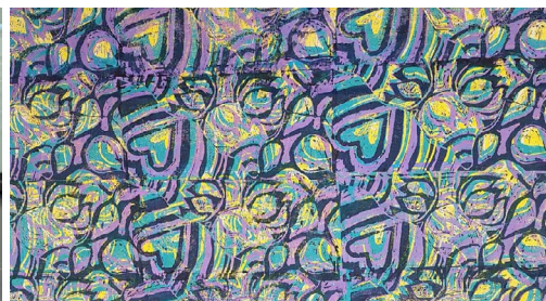
YR 7 VISUAL ARTS