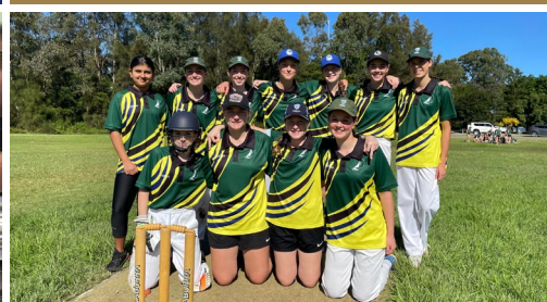
OPEN GIRLS CRICKET