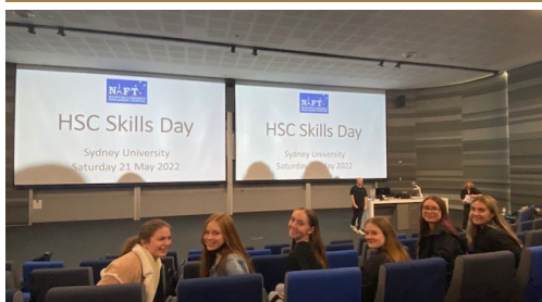
YR 12 FRENCH STUDY DAY