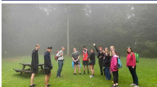
YR 12 TRIP TO DORRIGO