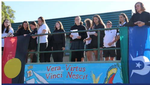
SORRY DAY ASSEMBLY