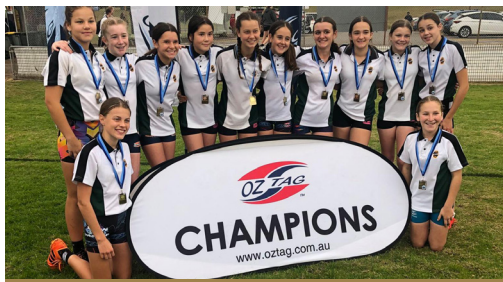
BOY & GIRL OZTAG CHAMPS