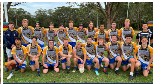
RUGBY LEAGUE SUCCESS