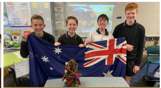
CHRISTMAS IN 'JULY'