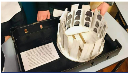
YR 7 CIVI-CON