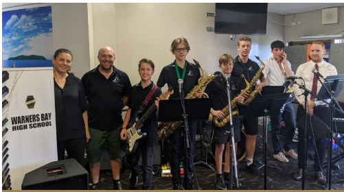
BAND ON THE GREEN