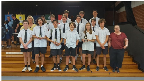
CHESS MANIA AT WBHS