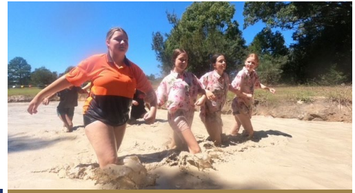
YR 9 RAW CHALLENGE