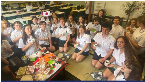
YR 8 JAPANESE TEA CEREMONY