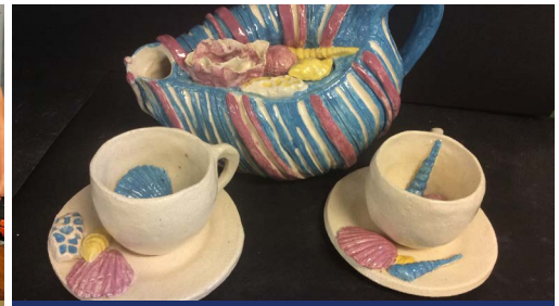
FANTASY TEAPOT ROADSHOW