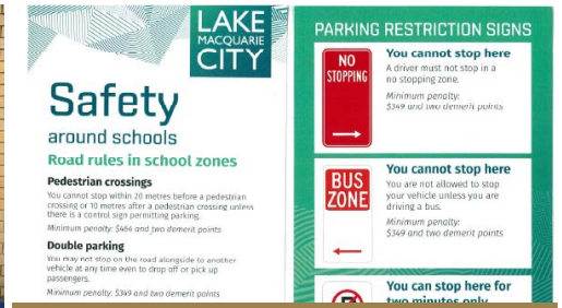
SCHOOL PARKING ZONES