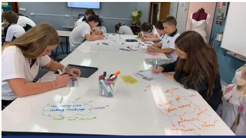
LEARNING WITH THE FUTURE