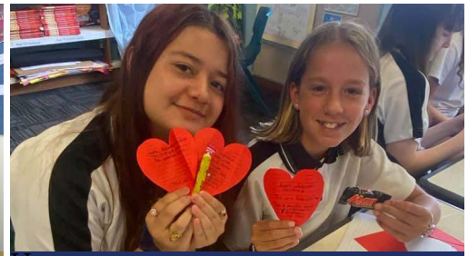
FESTIVALS, FOOD & WRITING