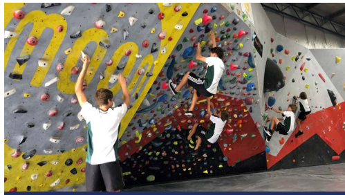
CLIMBING THE WALLS IN SPORT