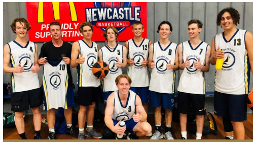
OPEN BOYS BASKETBALL