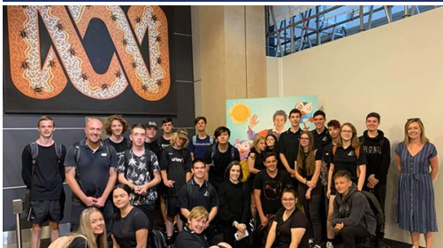
YRS 10/11 VISIT NIDA & ABC STUDIOS