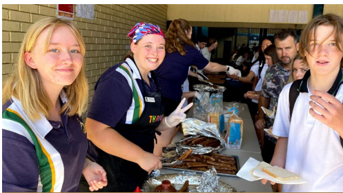
FIRE RELIEF FUNDRAISER