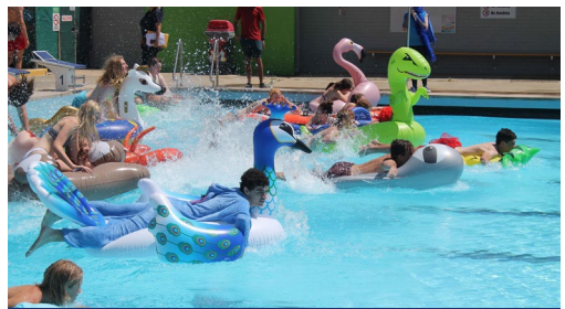
SWIMMING CARNIVAL GALLERY