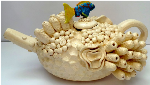
YR 10 CERAMICS EXHIBITION