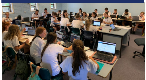
YR 7 MATHS