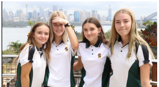
YR 9 VISUAL ARTS EXCURSION