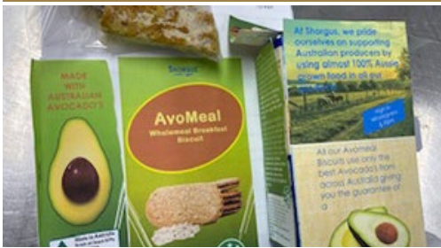
YR 12 FOOD TECHNOLOGY