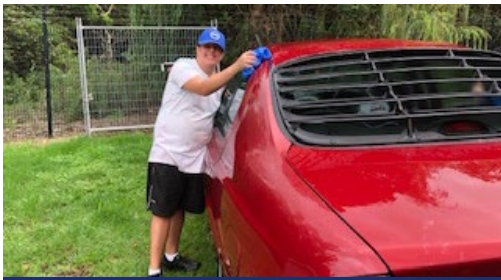
SUPPORT UNIT CAR WASH