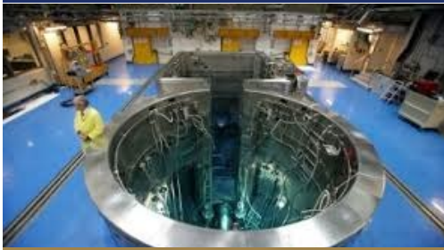
YR 11 CHEMISTRY EXCURSION