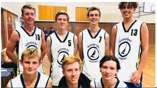
OPEN BOYS BASKETBALL