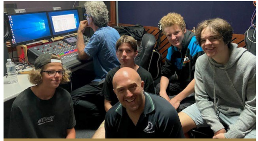
'NAZETH' RECORDING WINNERS