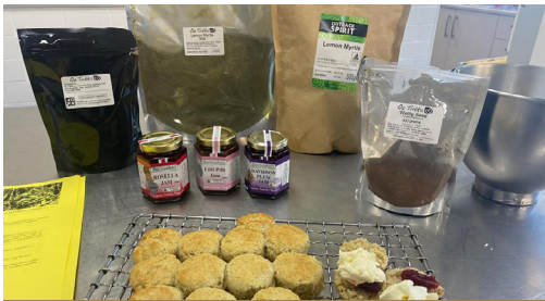
BUSH TUCKER COOKING