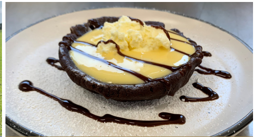
YR 9 CHOCOLATE SENSATIONS