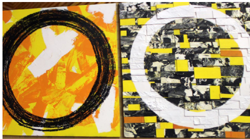
HSC VISUAL ARTS VIRTUAL DISPLAY