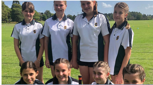
GIRL'S CRICKET SUCCESS