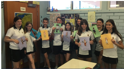
BUSY TIME IN LANGUAGES