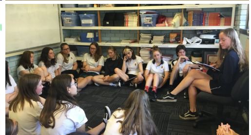
YR 10 FRENCH