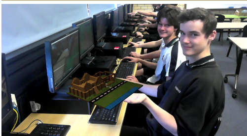
YR 10 TOWN PLANNERS